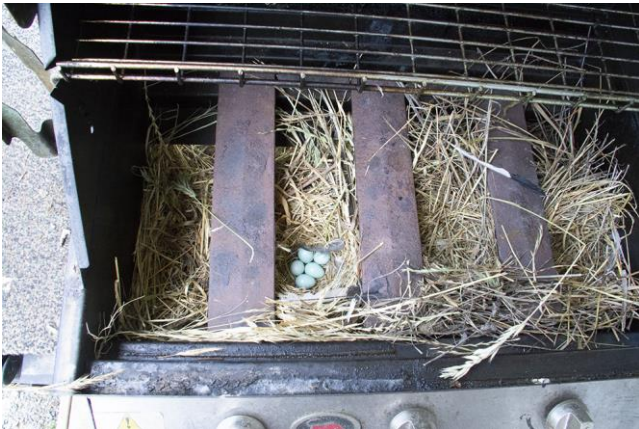
A lot of work went into building these nests.