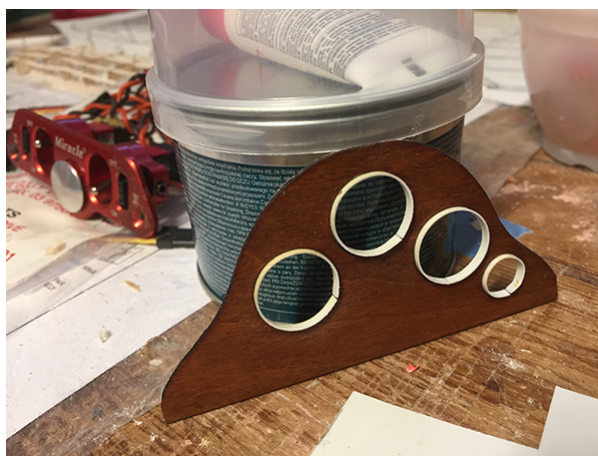
Left, the Avro Avian's instrument panel with the bezels from plasticard cut to length and superglued in place. If any of you have alternative methods for producing Instrument panels and would like to share your methods, please feel free to email me and I will include it in the newsletter.

Below the finished article ready for installation into the Avion. I do need to improve the representation of the screws though!