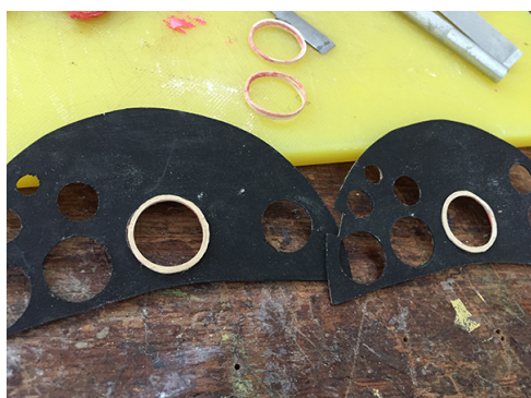
The two Magister panels with their largest bezels glued in place. I can see this method clearly has it's merits but the bezels required an awful lot of cleaning up before they could be used. Surprisingly the body filler is quite strong and nowhere near as fragile as you may think.