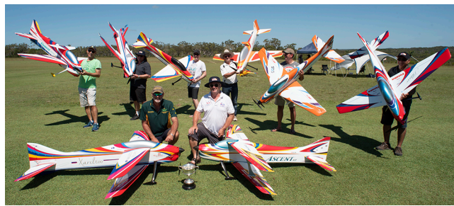
The Australian team.