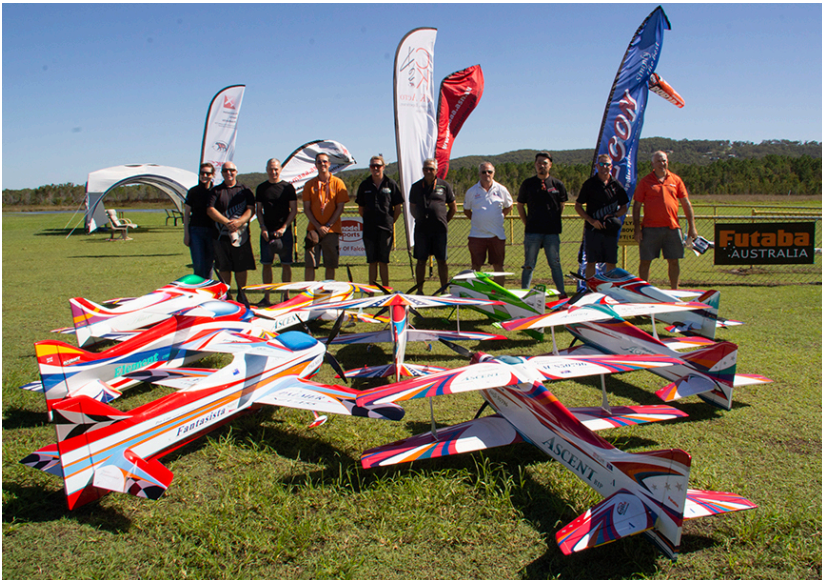
Top 9 F3A pilots for the Masters F schedule fly off.