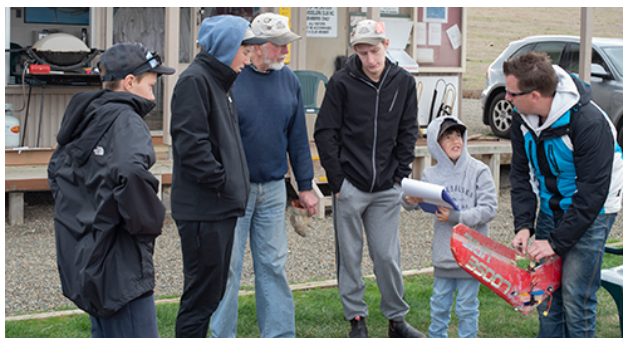
Club comp day, read within.

We are indebted to Ivan and Bruce for their help in drawing this to a conclusion. We have also updated the VMAA of this. I sent them a PDF file giving them a highlevel overview of everything that's happened over the past 14 or so months. We will continue to use the sign in/out register as this will provide valuable data should we need it in the future. We will also continue to randomly noise check all types of models to ensure we do not provide any grounds for complain. Other than that, life's good! Have fun and enjoy your flying.