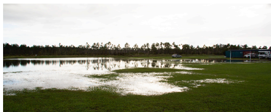
Masters flightline – Friday...