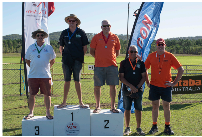
2019 World Championship team for Italy