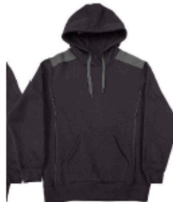
BLACK/ASH (ADULTS ONLY)