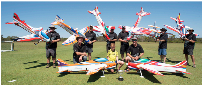
The Kiwi team – defended their crown.