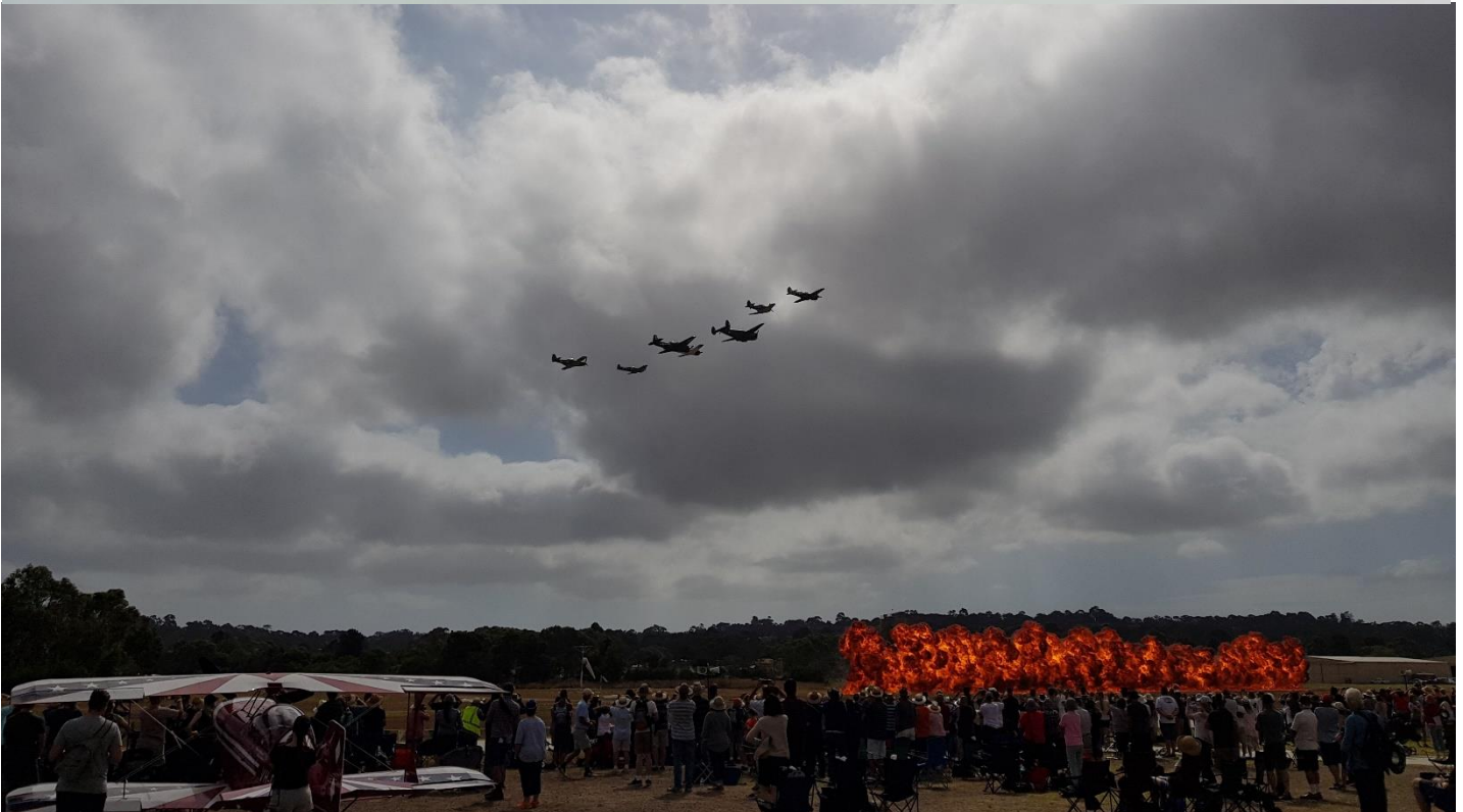
The finale, flyover of warbirds and some fireworks, job done, where going home.