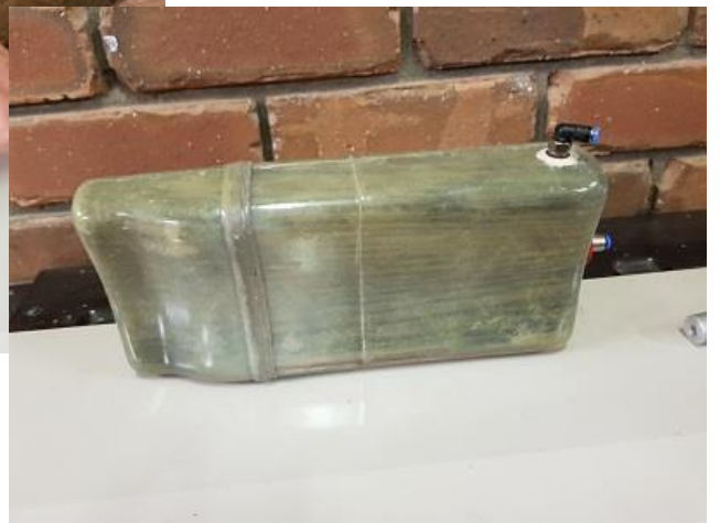
Right: one of the homemade moulded fuel tanks for the Mirage.