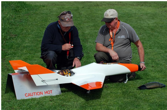
The communal start of the Electric Climb and Glide...